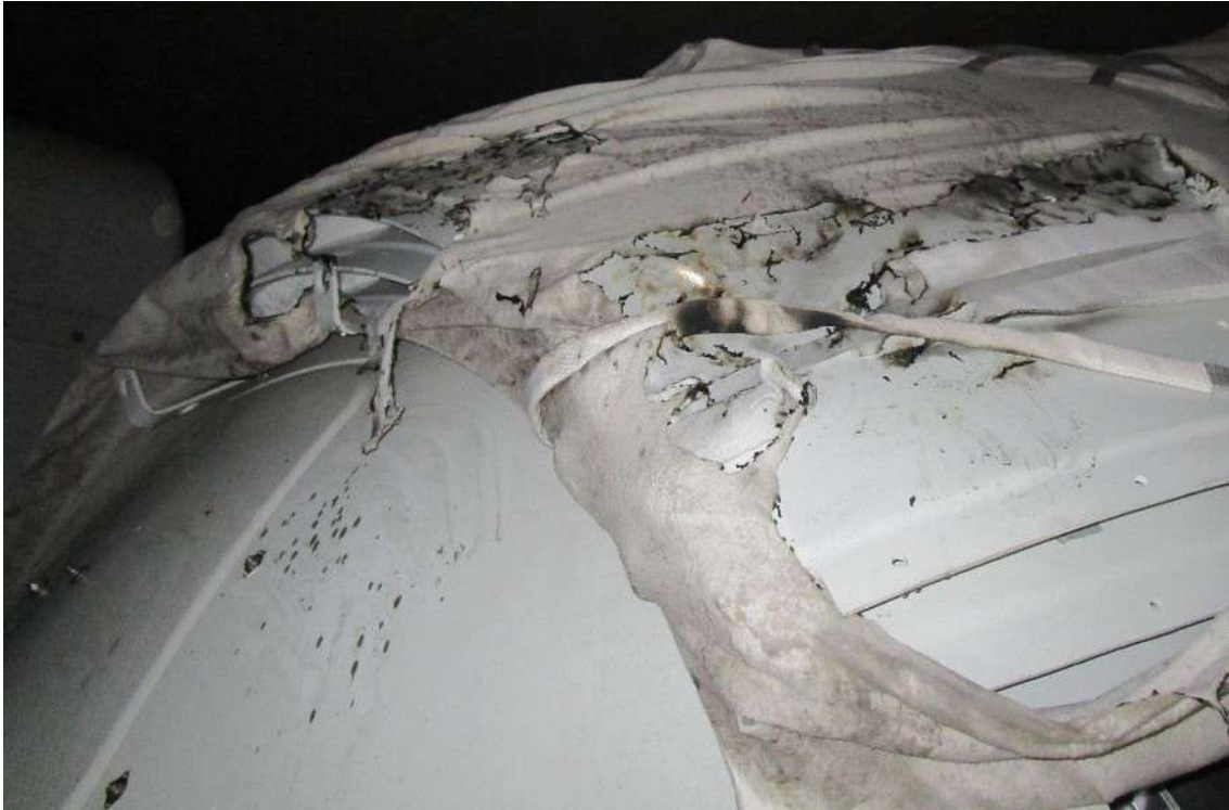
Figure 4: Cargo covering material and cargo surface damage