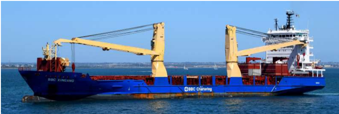
Figure 1: BBC Xingang