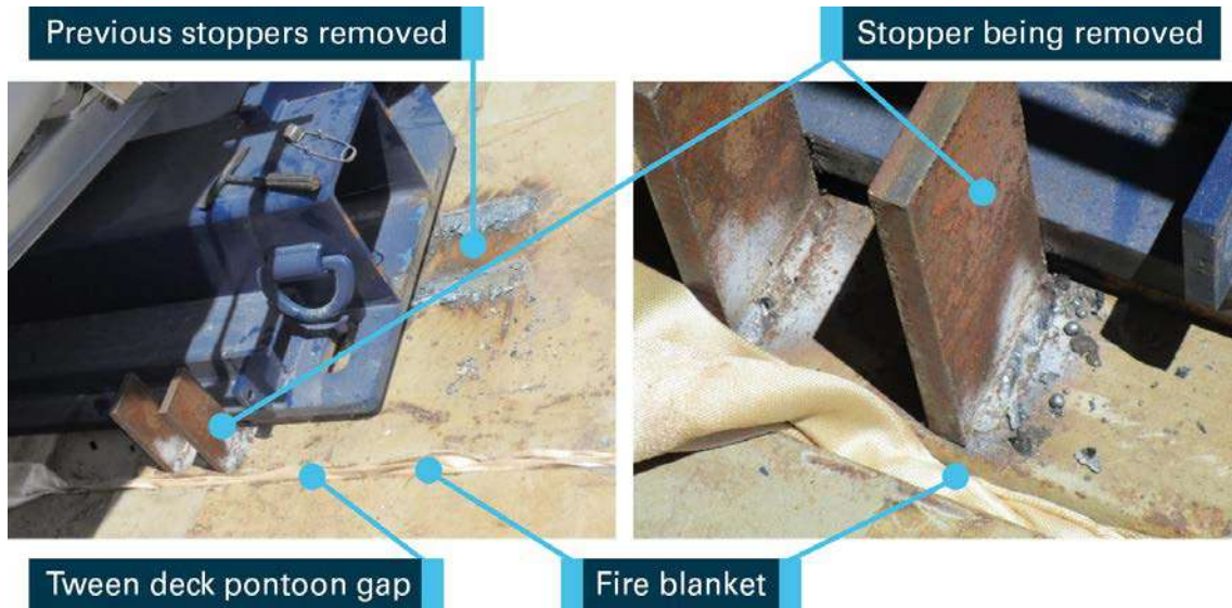
Figure 2: Worksite showing stoppers, after the incident